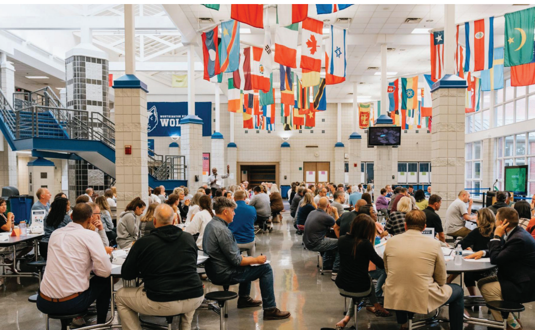
The District held the inaugural Design Team meeting on Wednesday, September 13th. It was a highly productive session focused on how the global landscape is changing and what that means for the skills and mindsets our graduates will need to thrive in the future.